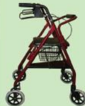
FOUR WHEELED ROLLATOR WITH BACK REST