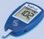
BLOOD GLUCOSE MONITORING