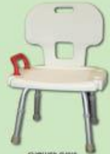
SHOWER CHAIR WITH BACK