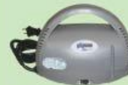
PORTABLE OXYGEN CONCENTRATOR